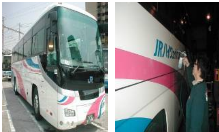
J R west Japan Bus